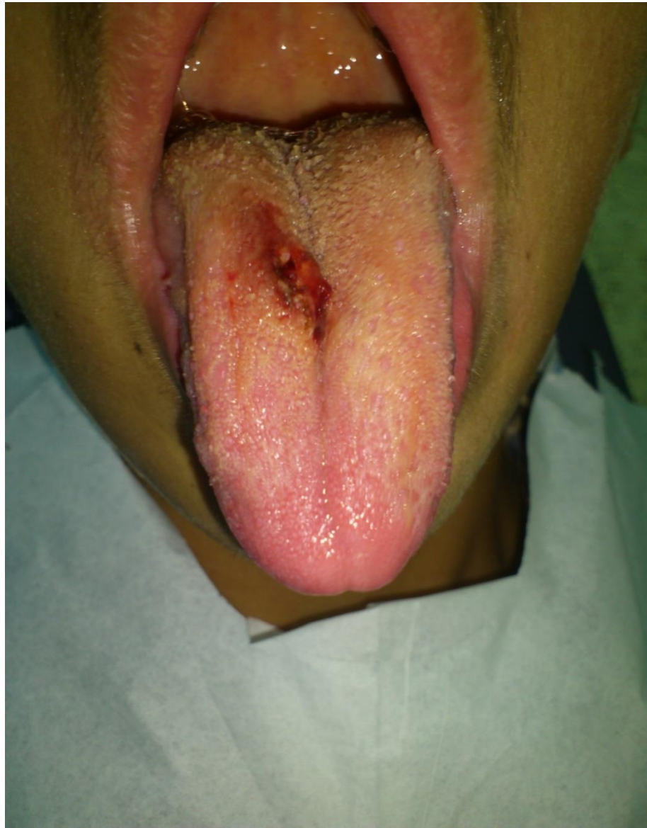
After Surgery – Anterior View