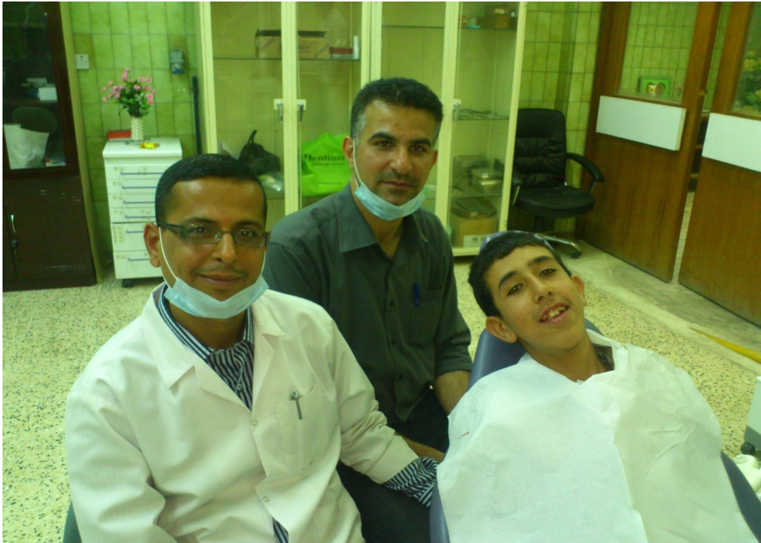
Surgical Staff with the Patient After Surgery