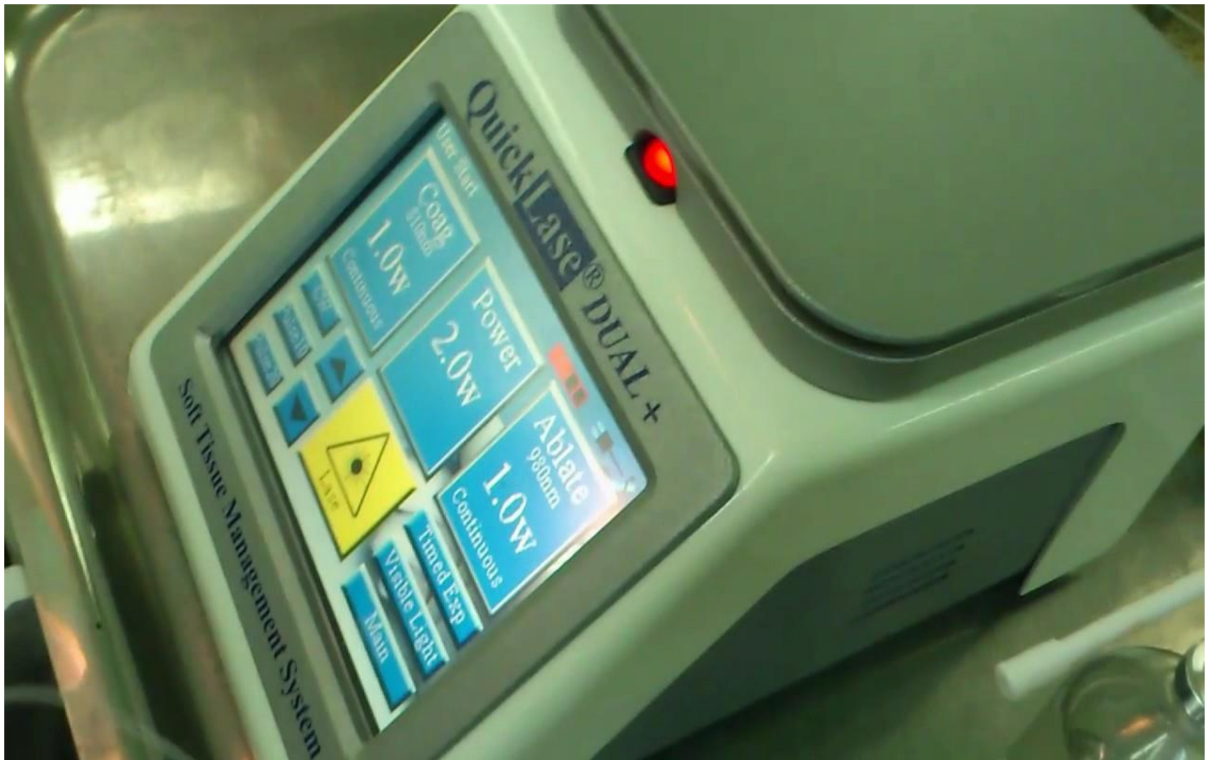
The Laser Device