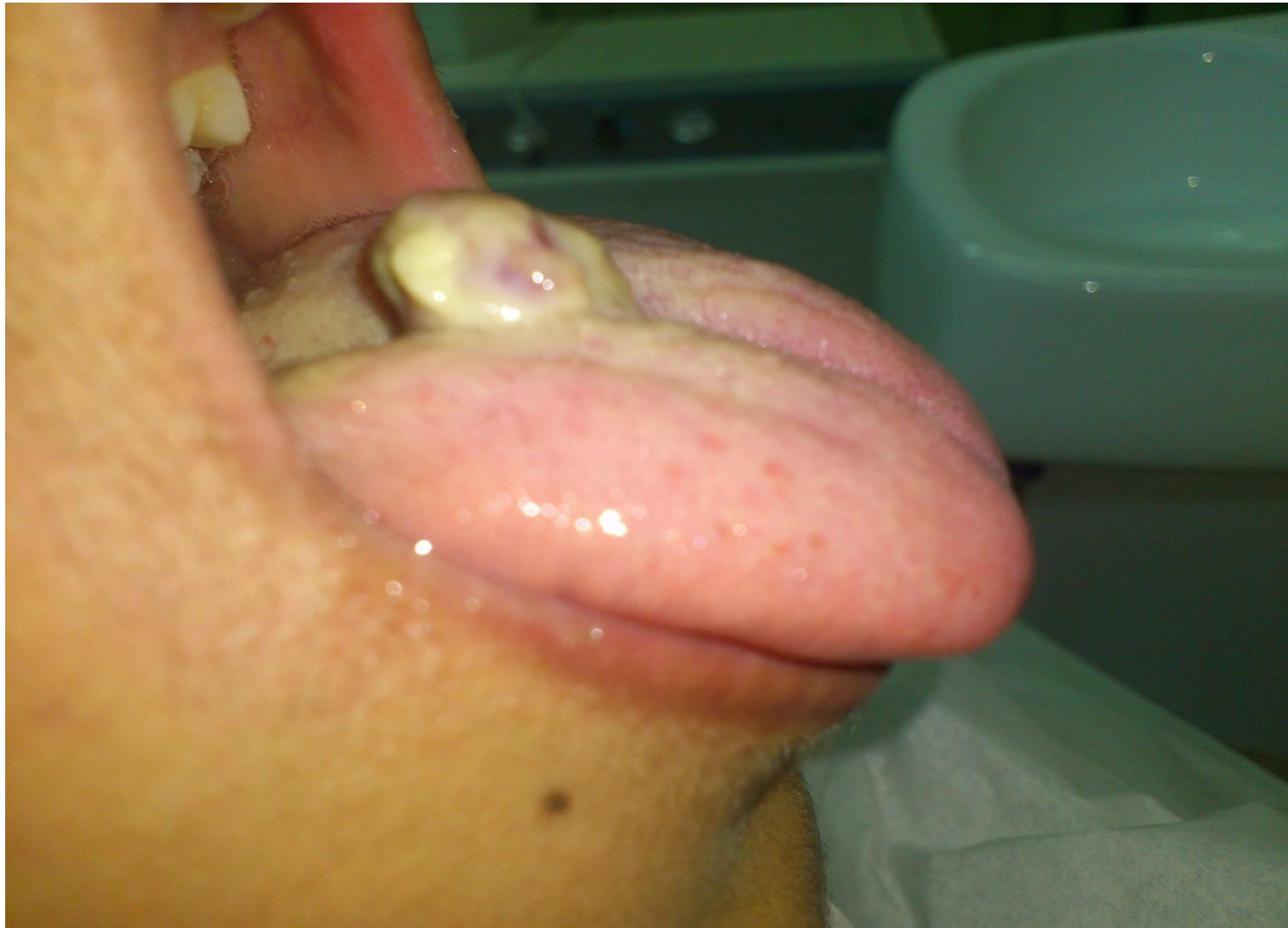
Before Surgery – Side View