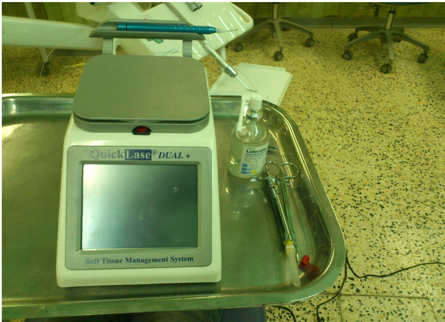
The Laser Device