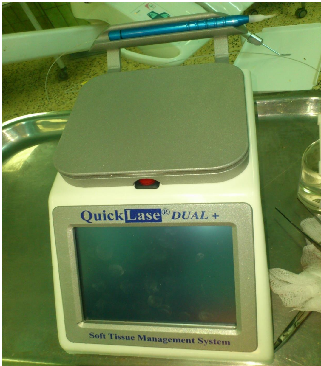
The Laser Device