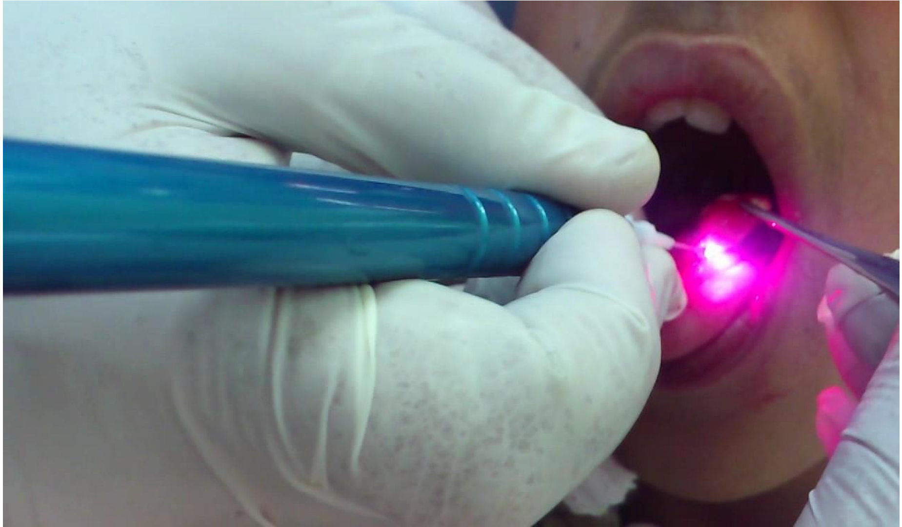
Final Cutting Step