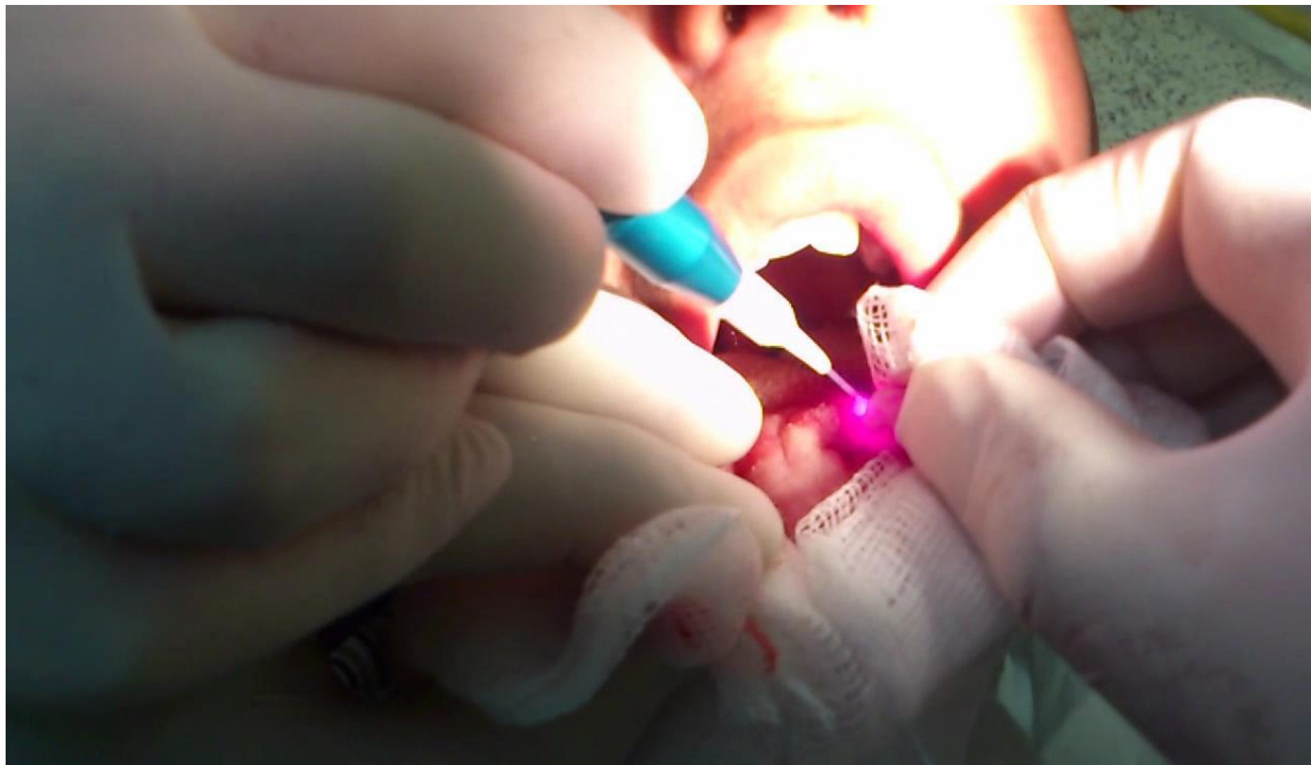
Initial Cutting with Laser